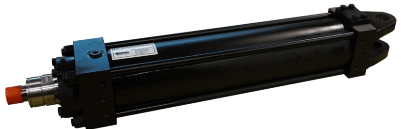
4" Bore Epoxy Coated with 17-4 PH Stainless Rod Cylinder