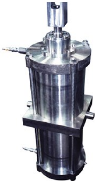
Power Plant Hydraulic Cylinder 12.6" Bore, 4500 psi full stainless cylinder