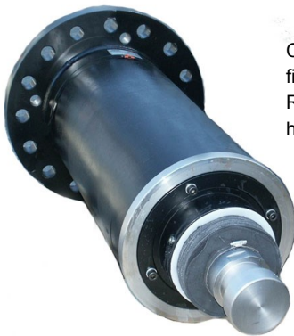
Conversion of 50 year old filter press 12" bore cylinder. Rear flange uses existing head bolt holes