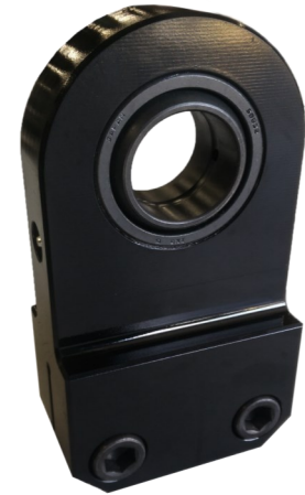
1 pc. Steel Clevis